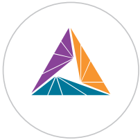
Social media profile